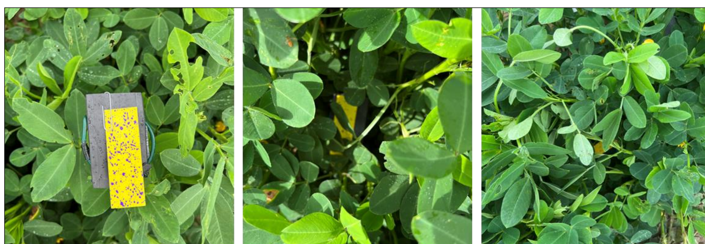
Arrangement of WSP in upper, middle and lower position of canopies